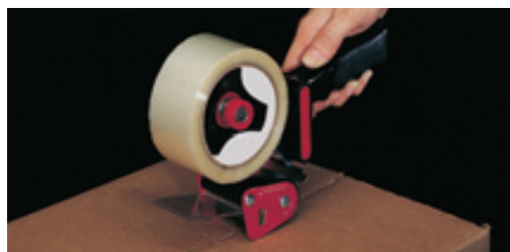
Easy one-hand dispensing.