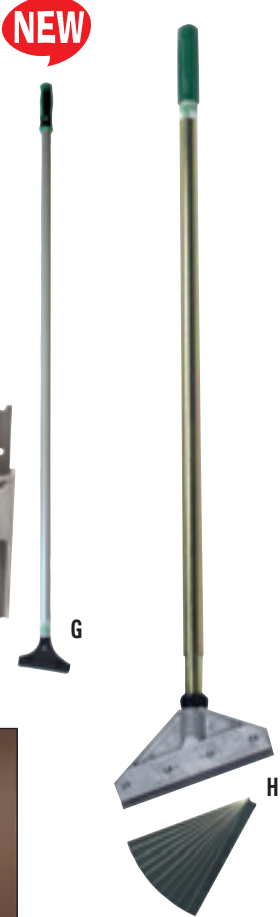
Replacement blades sold separately.